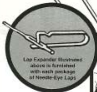
Lap Expander illustrated above is furnished with each package of Needle-Eye Laps

Packaged in dozen lots only (all one size), in individual envelopes with standard Lap Expander. Also available in Trial Assortment of 17 sizes.