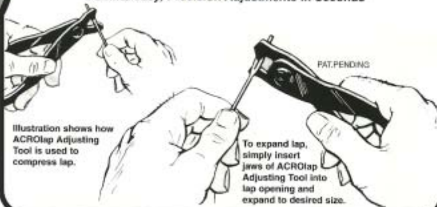
Illustration shows how ACROlap Adjusting Tool is used to compress lap.

Permits easy, Precision Adjustments in Seconds