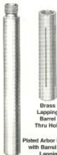
Plated Arbor Interchangeable with Barrel or Blind Hole Lapping Barrels