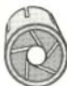
Special Eccentric Design Insures High-Speed Lapping Without Seizing

Above illustration shows how eccentric slots permit auto- matic slight-pressure of cyl- inder against work during fastest operations without danger of galling or seizing.