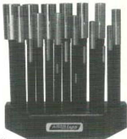
HARDWOOD HOLDS ACROlaps FOR INSTANT USE

New SET NO.12-Twelve (12) complete ACRO Super metric laps with hardwood base... sizes 3mm, 5mm, 6mm, 7mm, 8mm, 10mm, 12mm, 14mm, 15mm, 17mm, 20mm, 25mm Available in - Barrel Laps only