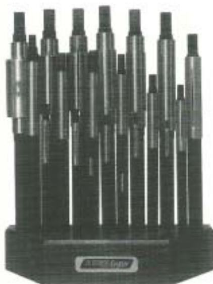
HARDWOOD HOLDS ACROlaps FOR INSTANT USE

Precision manufactured by veterans in the lapping industry, low-cost ACROlap Barrel Laps insure fast, accurate lapping of long or short holes 1/8" to 1-1/2" diameters. Instantly, accurately adjustable. Milled eccentric slots in brass barrel permit expansion of up to 15% or more by simply turning adjusting screw. Easy does it. No set-up time. No special equipment needed. Longer life built into each ACROlap greatly reduces your lapping costs.